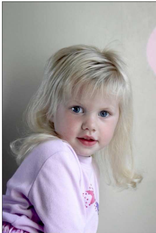
Figure 2 was snapped in natural light. Let's play with it and see what we get.

The first thing with any image is to get rid of the defects. In this case there is a pink halo appearing at the top right. There are many ways to get rid of the defect such as with the “clone” tool. Just for a change I used the “patch” tool which does a similar job.